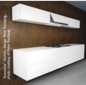
"Ecoforma" kitchen design, Peter Rathjens, photo courtesy of Peter Rathjens.